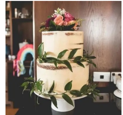
Cake Topper with Additional Loose Greenery