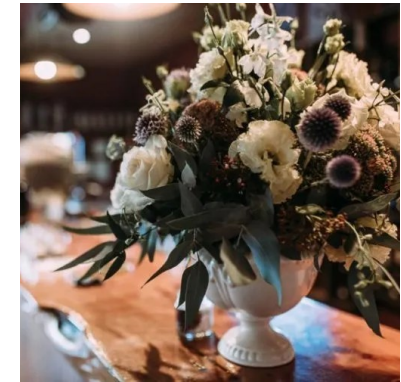
Bar Top Posy in Hired Vintage Vase