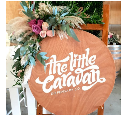
Hanging Signage Flowers