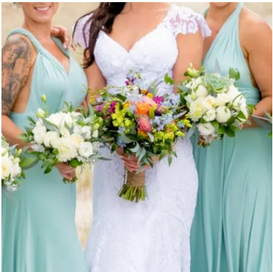
Contrasting Bridesmaids Bouquets