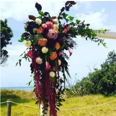
Single Part-Arch Arrangement