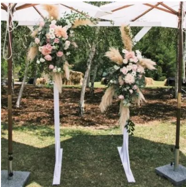
Two Part-Arch Arrangements