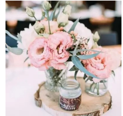
Small Posy Paired With Bud Vase Centerpiece