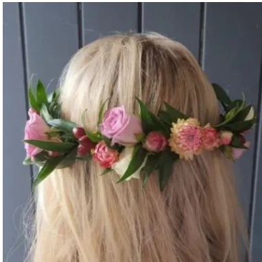
Kid's Flower Crown