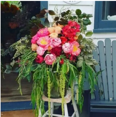
Large Standalone Display