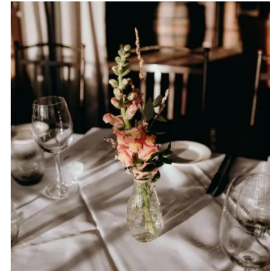
Bud Vase Centerpiece