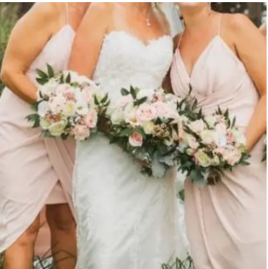
Matching Bridesmaids Bouquets