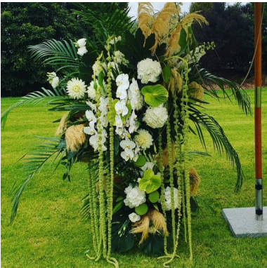
Large Standalone Display