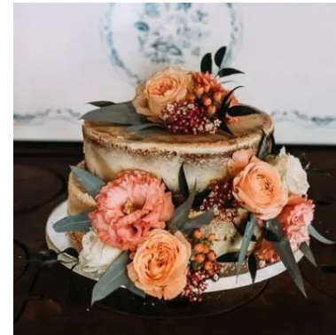
Cake Topper and Two Additional Clusters