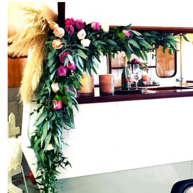
Large Hanging Garland

For hanging from ceilings, rafters, chandeliers, tables, etc.