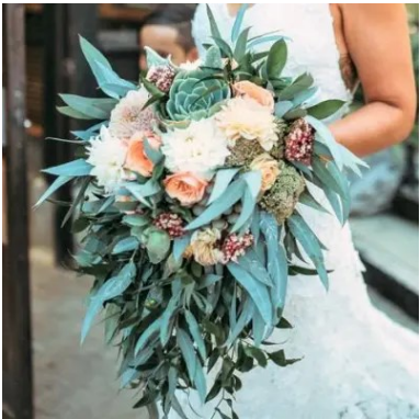
Large Cascading Bridal Bouquet