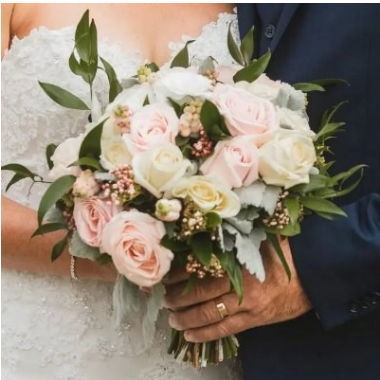
Regular Bridal Bouquet