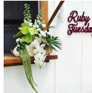
Bar Top Posy in Hired Vintage Vase

For bars, signing tables, gift tables, etc.